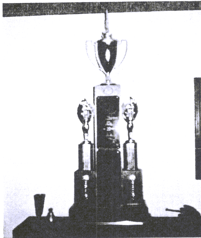
This is the Rockwell Trophy awarded annually by NAR's LAC Committee for the Section Newsletter voted as the best of the year. Do you know in what year our newsletter The Launch Rack won this award? Do you know who the editor was?

"A risk is a chance you take; if it fails you can recover. A gamble is a chance taken; if it fails, recovery is impossible." Erwin Rommel