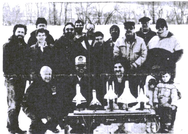
This was taken at the January 25, 1987 launch after the Challenger loss a year earlier. Each GSSS member was invited to bring their shuttle model to launch in memory of the crew. How many of these folks do you recognize? Many are still members.